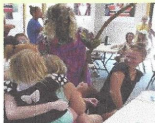
Eat Your Vegetables!