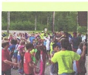
Waiting for lunch!