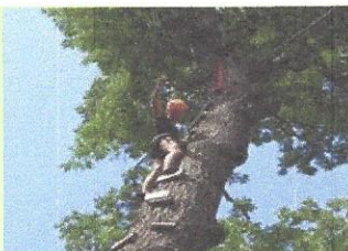
Smitty's Revenge—I did it!